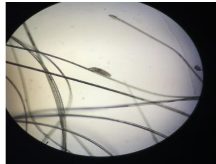
Fig 4 Egg with developing mite

Treatment and control of ectoparasites using chemicals i.e. acaricides and insecticides is still promising with certain parasites. Incidences of unusual parasites are increasing as far as pet animals are concerned.