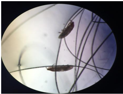
Fig 1. Lynxacarus radovskyi adults clinging onto the hairs

Based on reports, L. radovskyi was found to be susceptible for commonly used acaricides and treated successfully. This case was treated with Fipronil (PROTECTOR*) spot on and found that the animal has recovered during the follow up. This case of fur mite is found to be the first report of this parasite in Puducherry region. Ectoparasite infestation on pet animals can be easily controlled with better management practices.