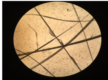
Fig 2. Eggs found attached to hairs of the host