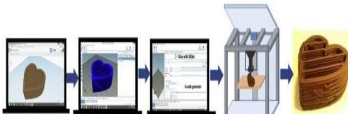
Fig.1 Mechanism of 3D printing