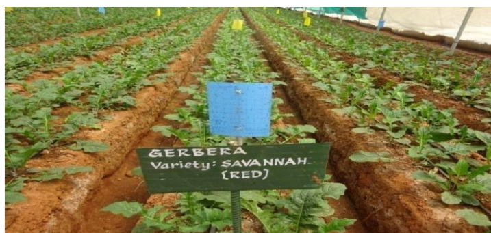
Fig.1 Field view of Gerbera cultivation