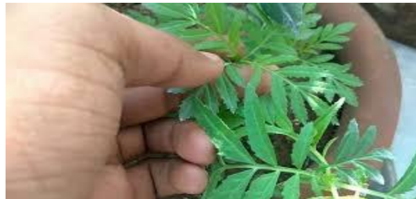
Fig.3 Effect of pinching in Carnation