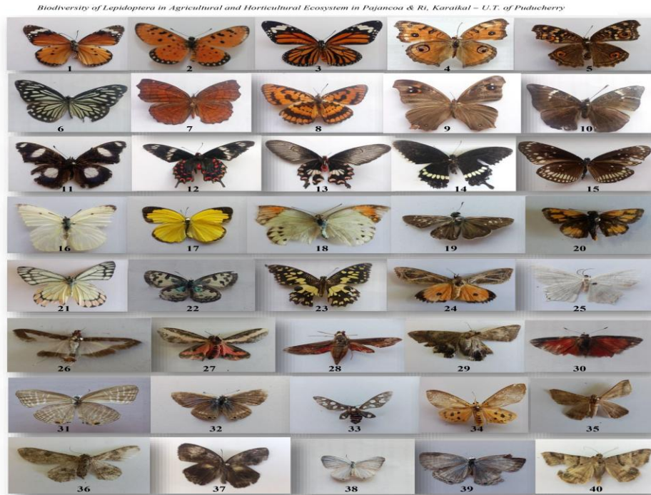
1. Danaus chrysippus , 2. Acraea violae , 3. Danaus genutia , 4. Junonia almana , 5. Junonia lemonias , 6. Teliervo limniace , 7. Ergolis merione , 8. Byblia lithia , 9. Melanitis leda ismene , 10. Euthalia acanthae , 11. Hypolimnas miscipes , 12. Pachilopta aristolochia , 13. Pachilopta hecetar , 14. Papilio polytes , 15. Euploea core , 16. Catopsilia pyranthe , 17. Eurema hecabe , 18. Hebomia sp., 19. Pelopidas mathias , 20. Telicota ancilla , 21. Delias eucharis , 22. Castalius rosemon , 23. Papilio demoleus , 24. Othreis matera , 25. Semiothisa pervolvata , 26. Eudiotpes indica , 27. Rajendra irregularis , 28. Hippotion celerio , 29. Achaea janata , 30. Raphala varuna , 31. Lampides boeticus , 32. Euchrysops cnejus , 33. Syntomis thoracica , 34. Asota ficus , 35. Unidentified, 36. Unidentified, 37. Unidentified, 38. Unidentified, 39. Unidentified, 40. Unidentified.