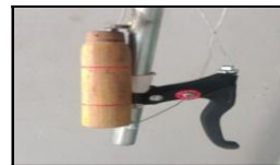
e) Handle / clutch