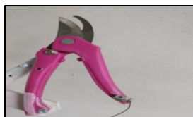
b) Cutting mechanism