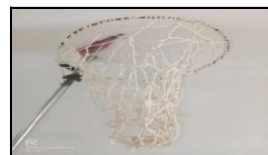
c) Fruit collection bag