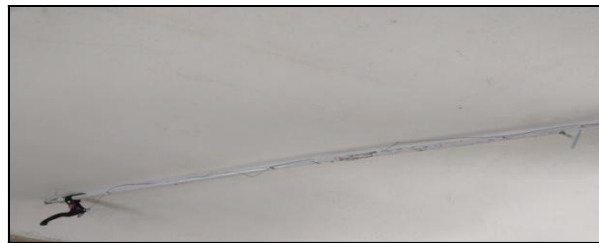
a) Extension pipe & adjustable pipe