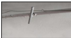
d) Adjustable mechanism