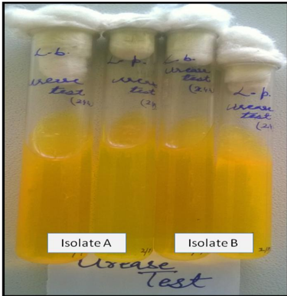
Fig.3 Orange yellow color of Urease media showing negative urease test for both isolates