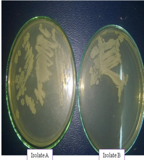
Fig.1 Growth of Isolated colonies of both the isolates A and B on MRS