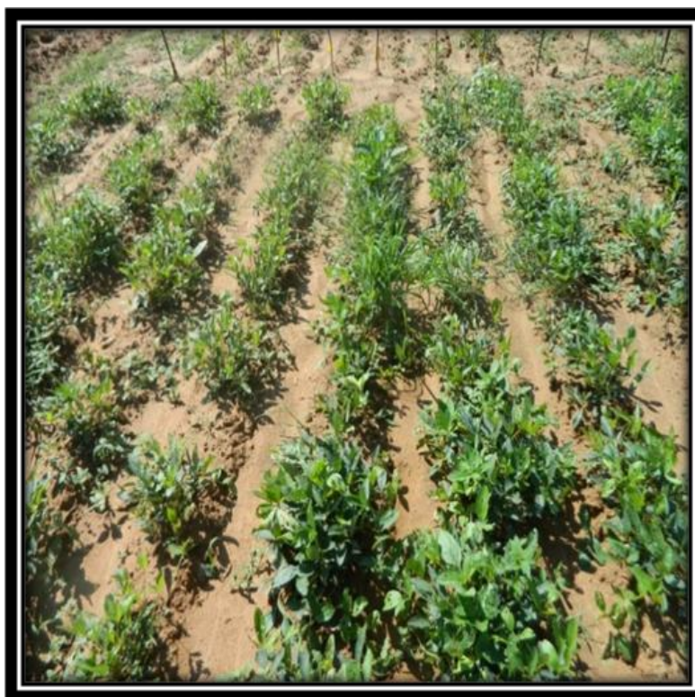
Figure.1 Field view of Bambara groundnut