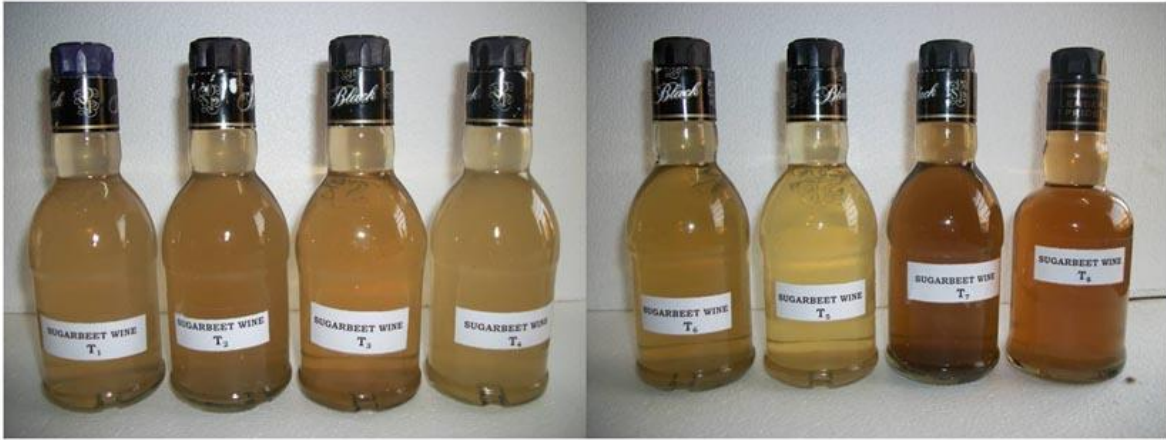
Plate 1: Sugarbeet Wine Prepared from Different Treatment Combinations